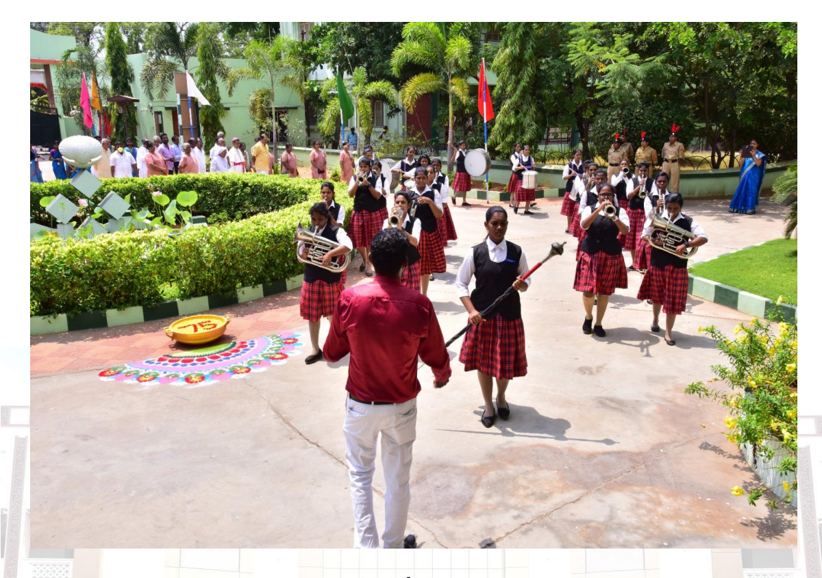
Marian Band Procession at 75<sup>th</sup> Jubilee Celebration Ceremony