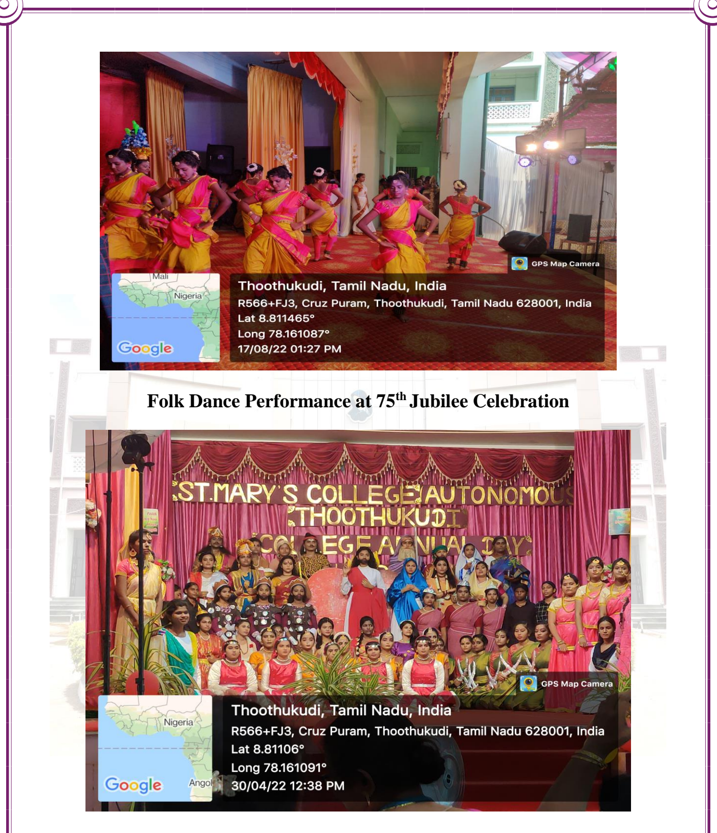
Tableau Performance at College Annual Day 2022