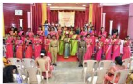
SSR Cycle V