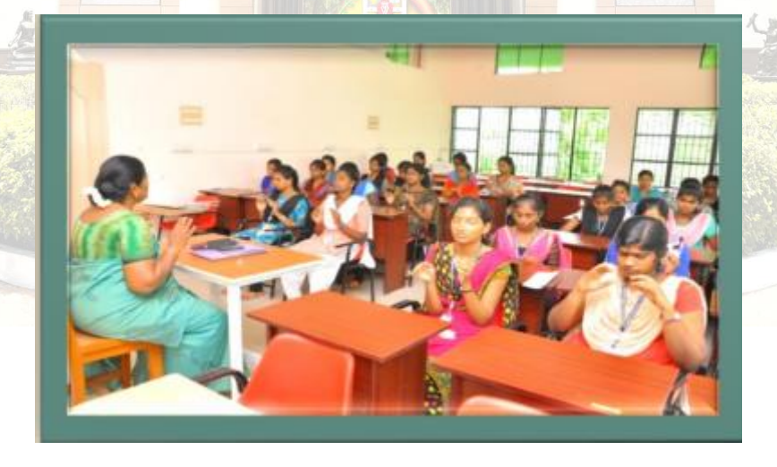
Techniques for Curing Ailments

Meditation classes were conducted regularly and the members of the healing club were given training to cure themselves and others. All the outgoing students were briefed on "Techniques for Curing Ailments". On all Fridays, the students of the college meditate for 15 minutes during the Morning Prayer.