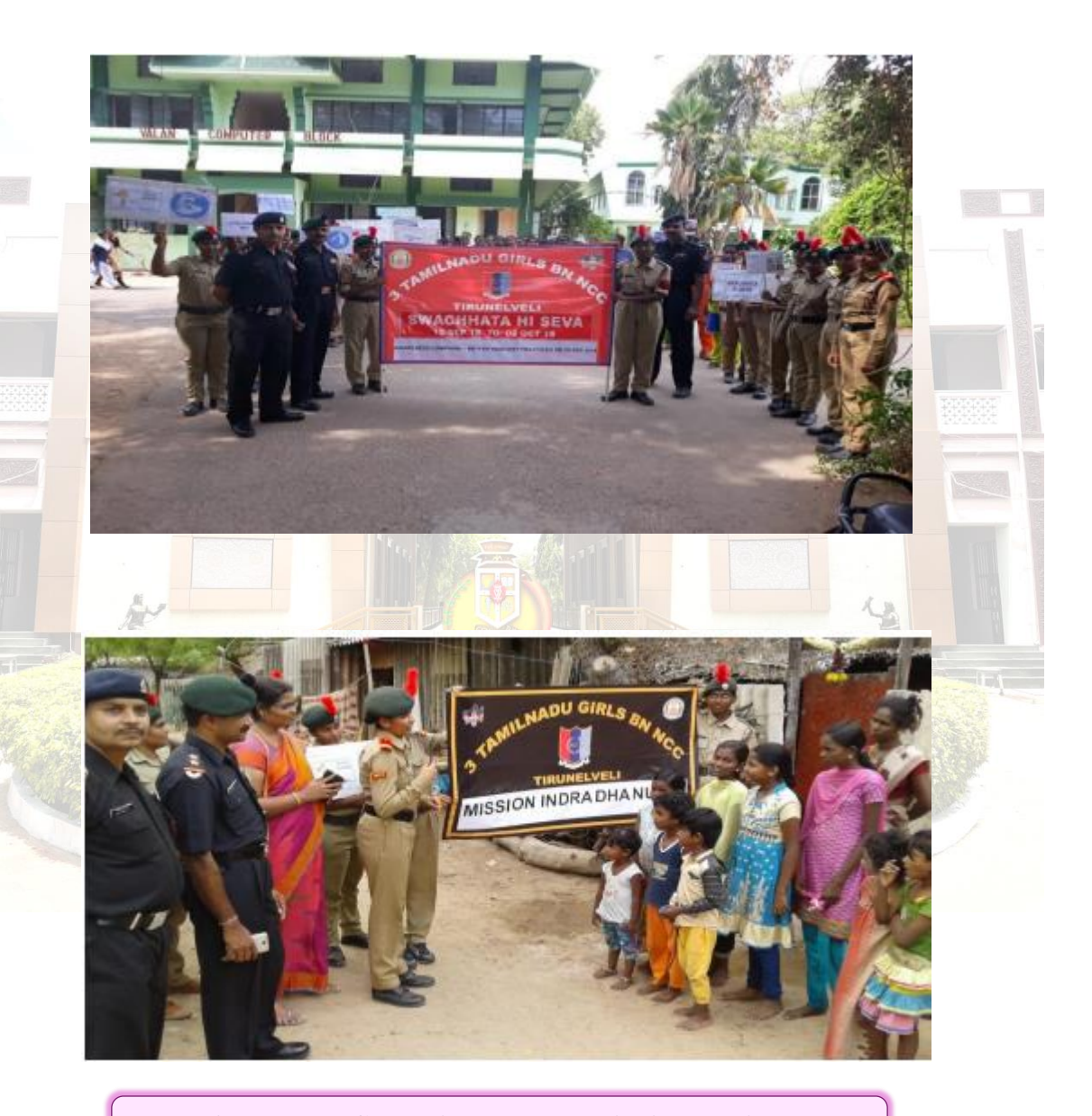
Awareness Campaign - Best Hygienic Practices

On extension of CDP and Social service programmes in NCC, our cadets conducted an awareness campaign on Swachhata Hi Sewa Best Hygienic Practices in the Labour colony, Thoothukudi. They also asked the residents to keep their environment clean and as part of it they also cleaned the beach and Port Hospital by being models/examples for others.