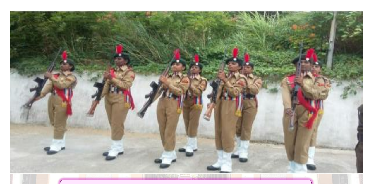
Steady Hands, Strong Resolve: NCC Cadets

The cadets involve themselves in all the programmes of the college like honouring special guests during committee visits, college functions and Independence Day, Republic Day ceremonies, etc., 23 and 21 cadets appeared for their 'B' and 'C' certificate examinations and all cleared the examinations with good grades.