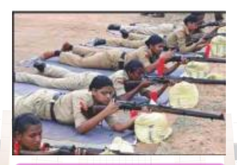
NCC Cadets demonstrating Rifle handling skill

various camps across the country. The cadets won many accolades by attending camps held at national level