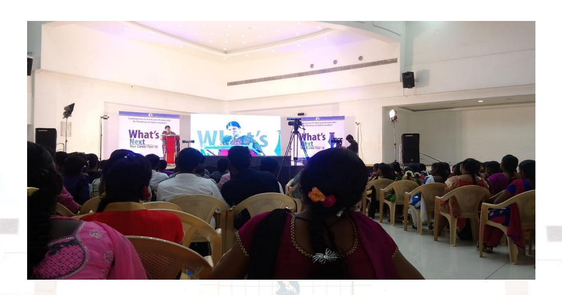
Career Fest - 2018

Final year students participated in the 'Career Fest' organised by the IT Companies on 13 October 2018 at AVM Mahal