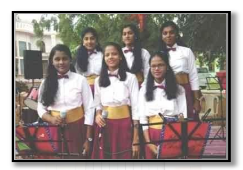
Melodious Blend of Talent & Teamwork