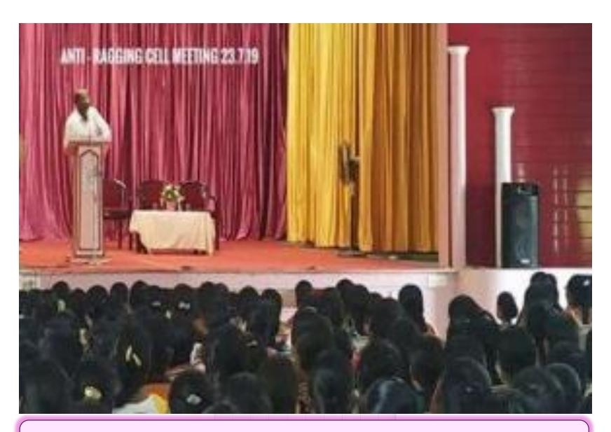
Lecture on Tamil Nadu Prohibition of Ragging Act

He instructed the students regarding the definitions of ragging, prohibition, penalty, dismissal and suspension of the student and deemed abetment. The students took Ragging Prohibition Oath to make the College Free Ragging Zone. 884 students and 36 staff were beneficiaries.