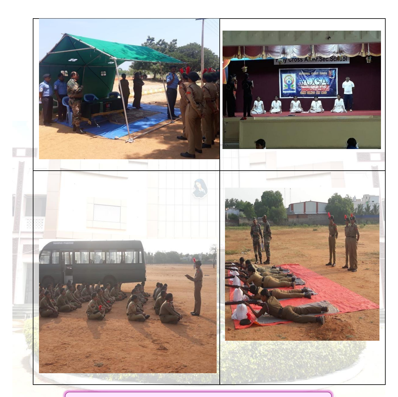
Activities of NCC

Thus, our cadets grow in self-discipline & an integrated personality through regular parades, adventure activities, knowledge-oriented classes and various competitions.