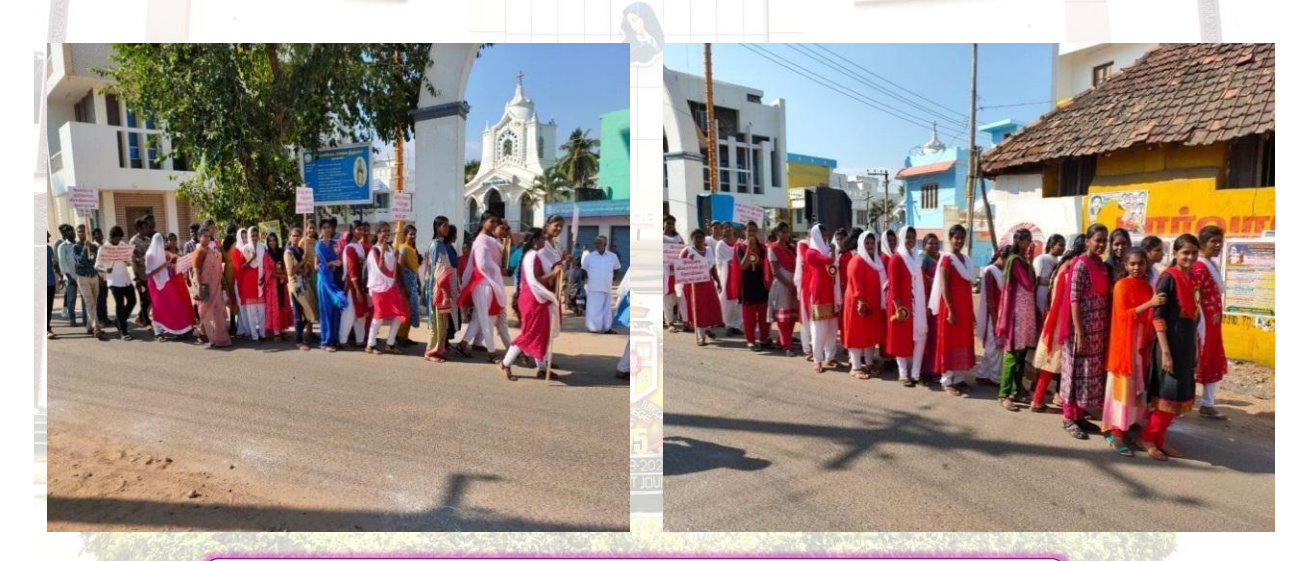
Inauguration of International Youth Year

• The AICUF members participated in the inauguration of the International Youth Year celebrated by the Tamil Nadu Catholic Youth Movement on 22<sup>nd</sup> January, 2020 at Kulaisal, Kanyakumari.