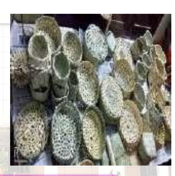
Productive undertakings - CDP

These progressive measures empower the rural poor, particularly women by enhancing their skills to have an earning of their own. We try to empower families and thereby villages as a whole socially and economically by giving ample importance to environmental conservation. We act as a bridge by bringing the needs of village people to the authorities, particularly the District Collector. Students disseminate their skills to the deserving people for bringing a social change, to empower the needy, to enhance their skills and to make them earn for themselves so as to make them economically independent.