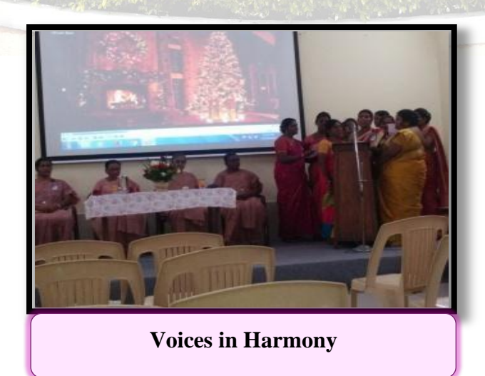
Criterion V SSR Cycle V

Marian choir is a wonderful way for students who enjoy singing to keep music in their lives. It inspires students to imbibe the culture of praise and worship and make it part of their daily routine. Students have regular practice every Monday and Thursday. Creating a heavenly presence in Eucharistic celebrations especially in first Friday mass, singing patriotic songs on national days like Republic Day and Independence Day, singing Prayer songs during Marian art fest sports day and graduation day are their incredible contributions towards the holistic moments of our college.