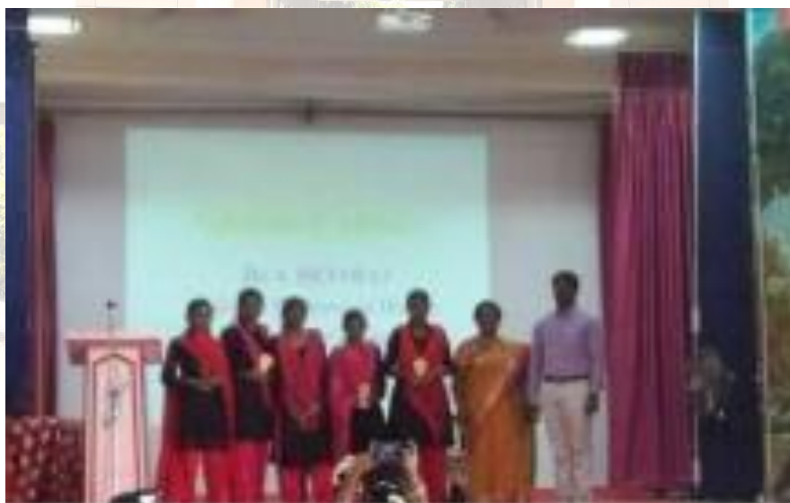
Winners of Histo – Fest 2019