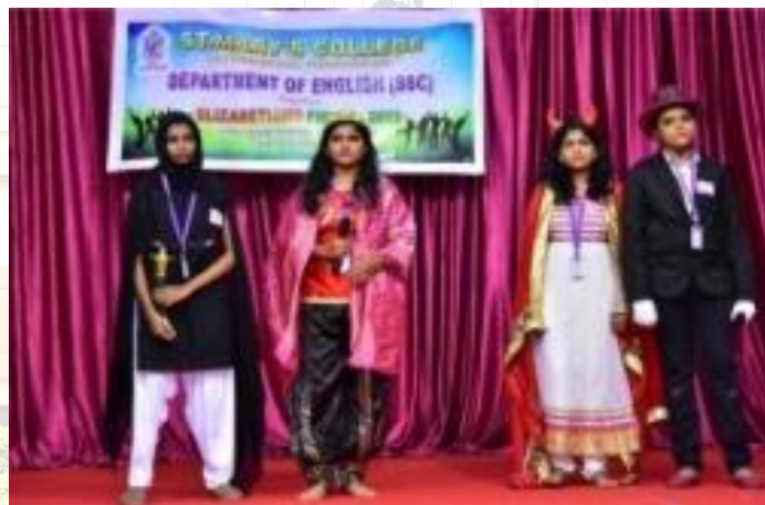
Young Budding Actresses on Stage