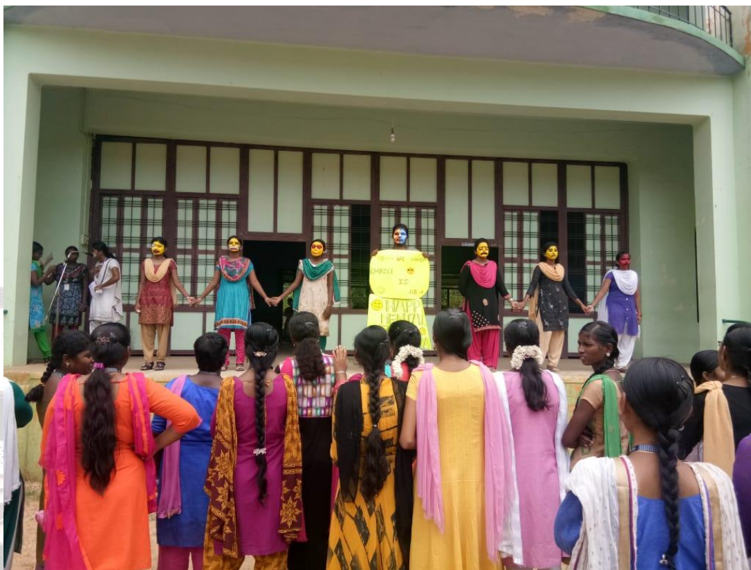
Face Painting Contest – 06.10.2018

was highly fruitful to the students, as it focused on one of the most important topics that need to be addressed to teenagers