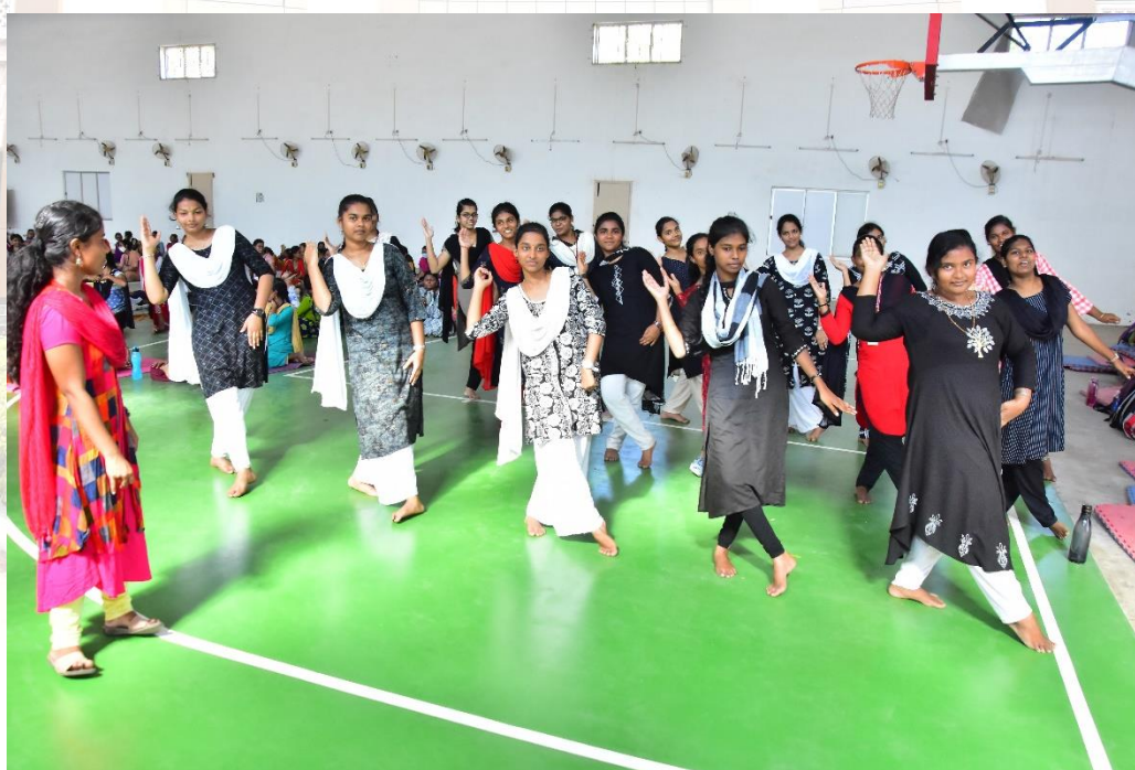
Dancing to the Tune