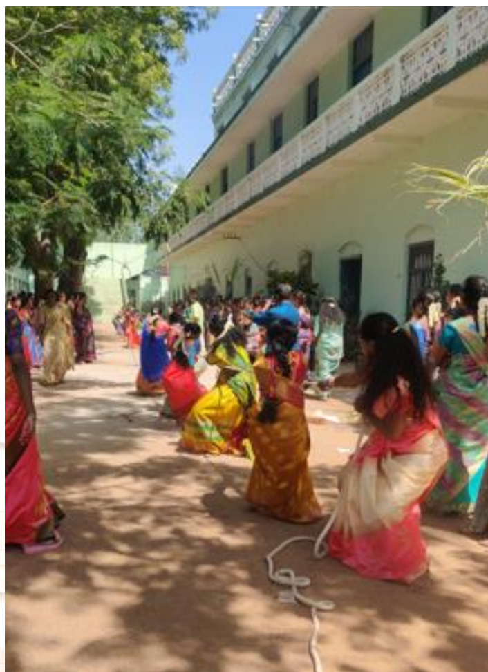
Tug of War Competition