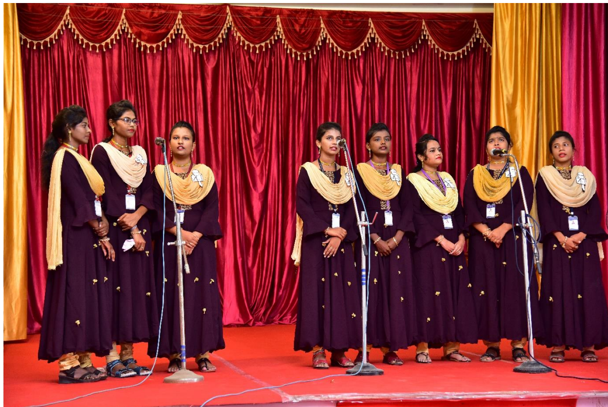
Dazzling Artists of Choral Singing

Department of English bagged the Over All Shield for group events and the Department of Commerce for single events in the Marian Art fest 2019.