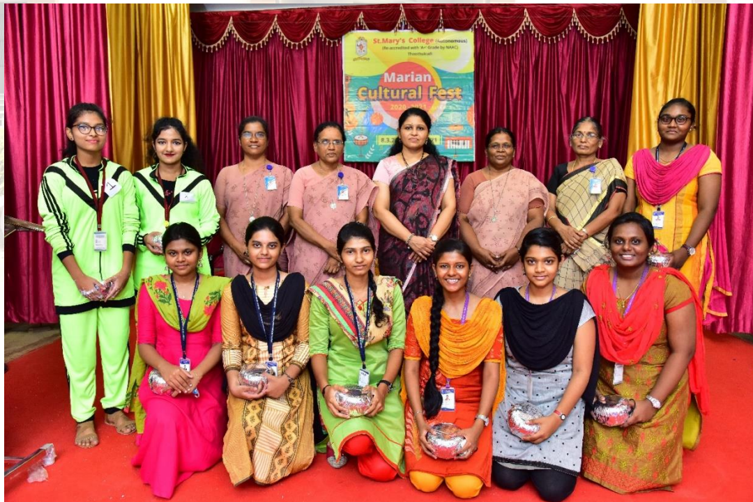
Winners' vibe unlocked with smile