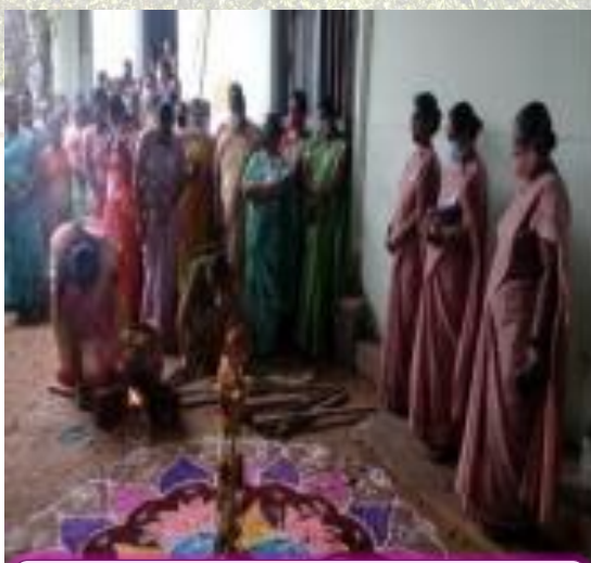
Festival of Harvest

Pongal, the festival of harvest was celebrated on 13 th January 2021. All the teaching and nonteaching staff enthusiastically celebrated the Pongal. Variety of games were conducted for the staff members and the winners were given prizes. The faculty members made the Pongal celebration as a memorable one through traditional Kolattam, Kummi and choral singing. Sweet Pongal was prepared by the staff.