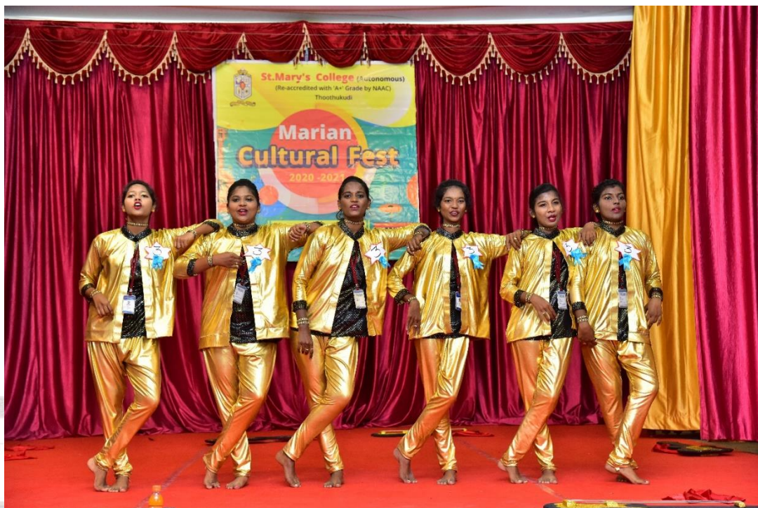
Sassy Steps ....! Classy vibes....!