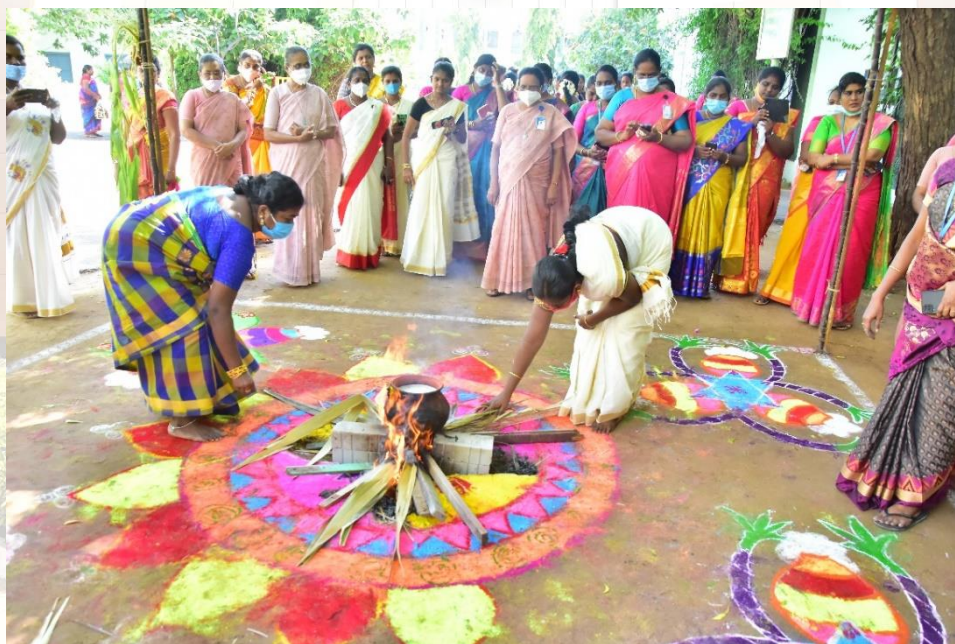
Harvesting Love and Prosperity