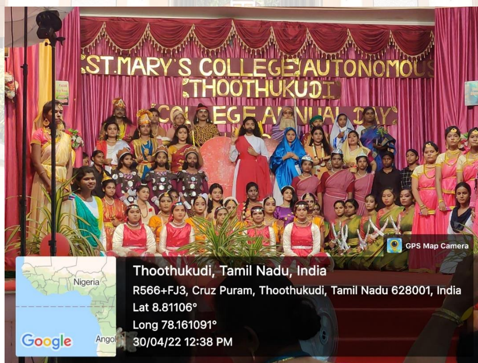
Tableau on Faith