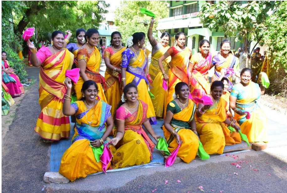
Movement of Joy