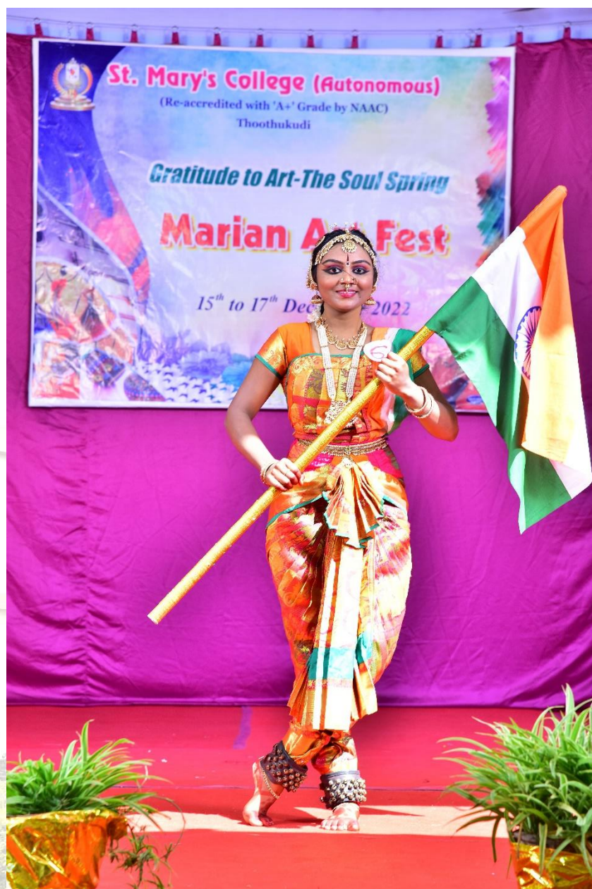
Unwavering Patriotic Spirit