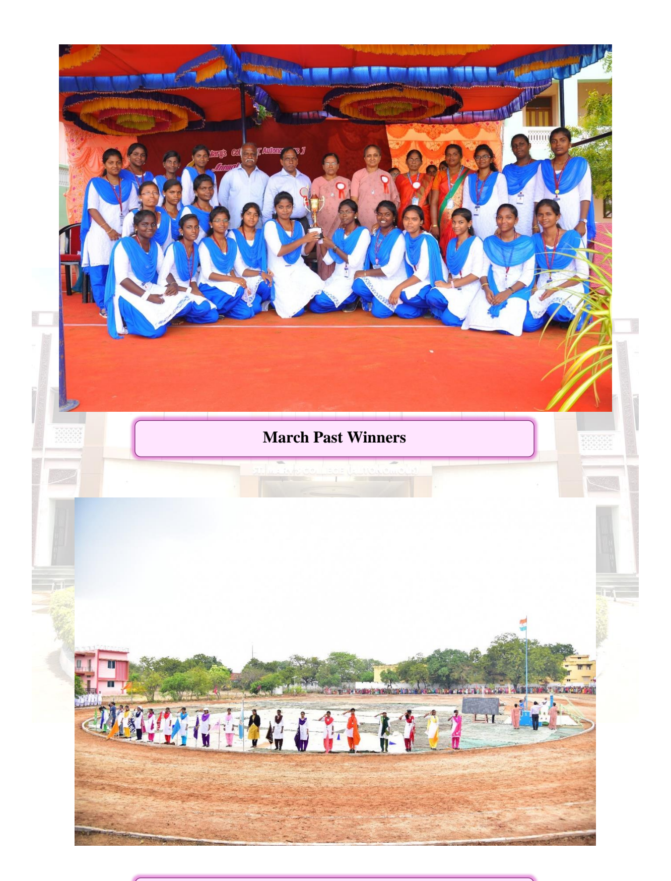
Showcase of Sports Discipline