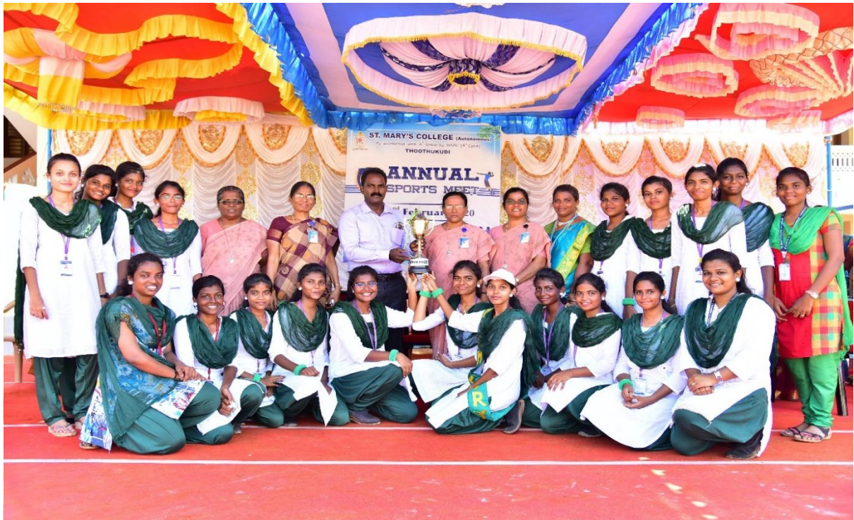
March Past Winners