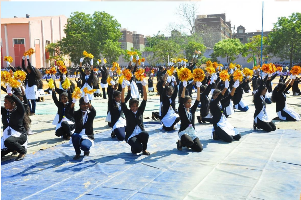
Spectacular Sports Activity