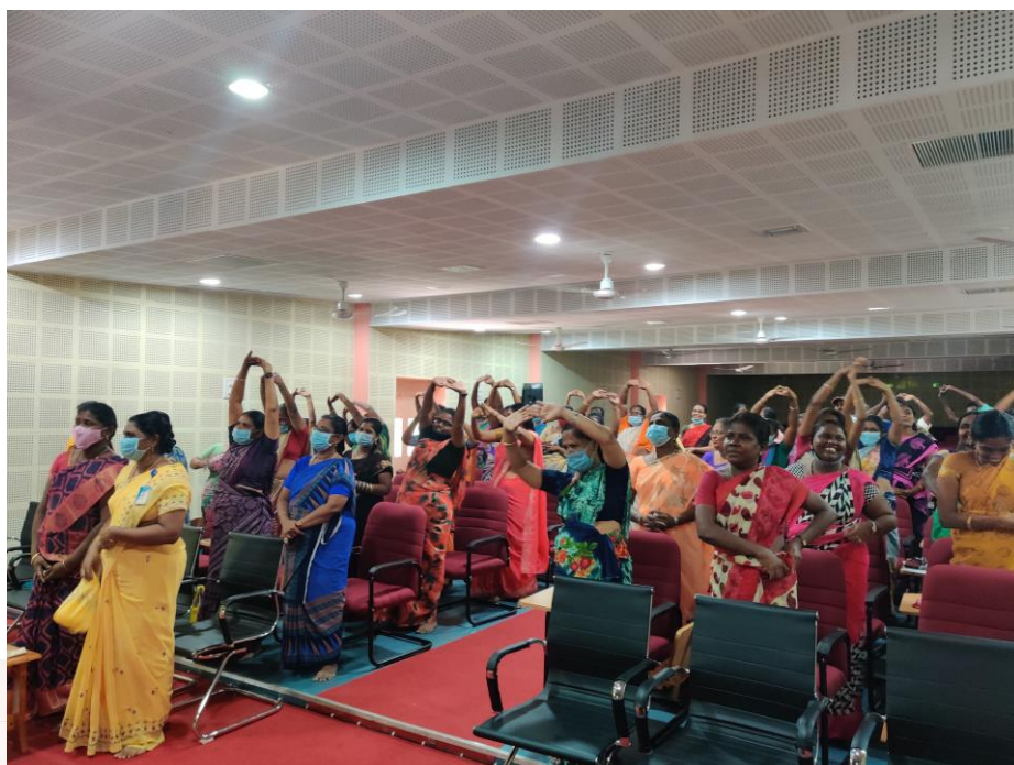
Description: Professional Progression Programme on “Life Skills and Dimensions of Well-being” for the Supportive Staff on 24.8.21 & 25.8.21