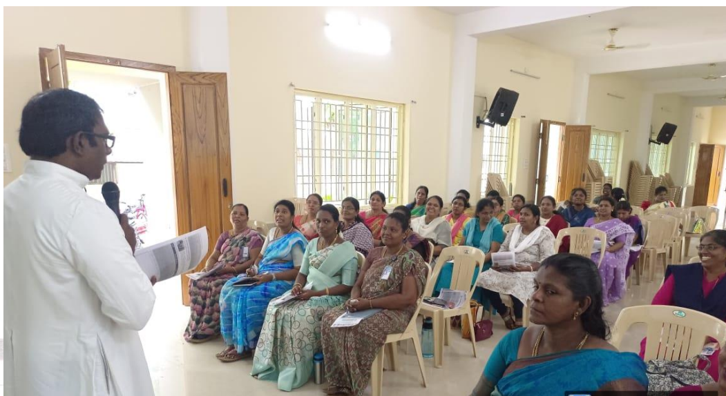
Description: Retreat for Catholic Staff