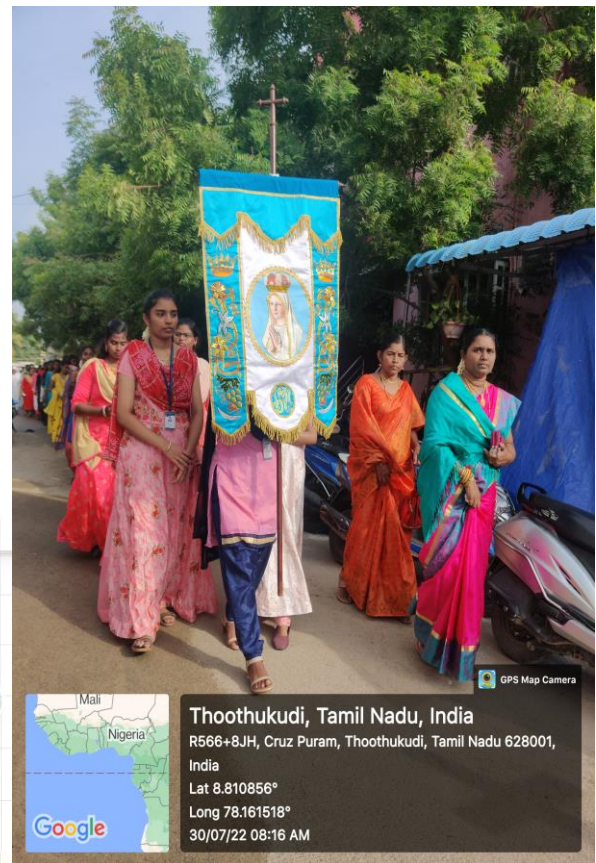
Description: Pilgrimage to OLS Mass