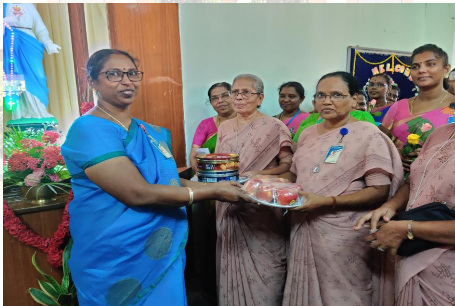
Description: Sharing of gifts on the Feast of Mother of Sorrows