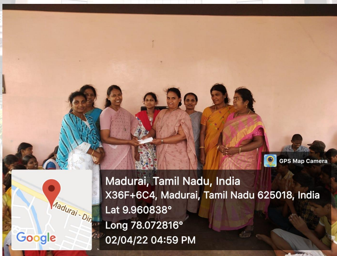
Description: Visit to Blind School, Madurai