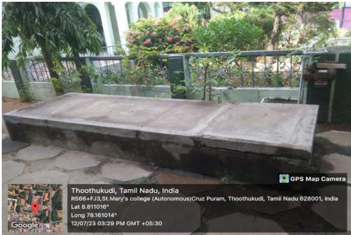
Waste Water Management