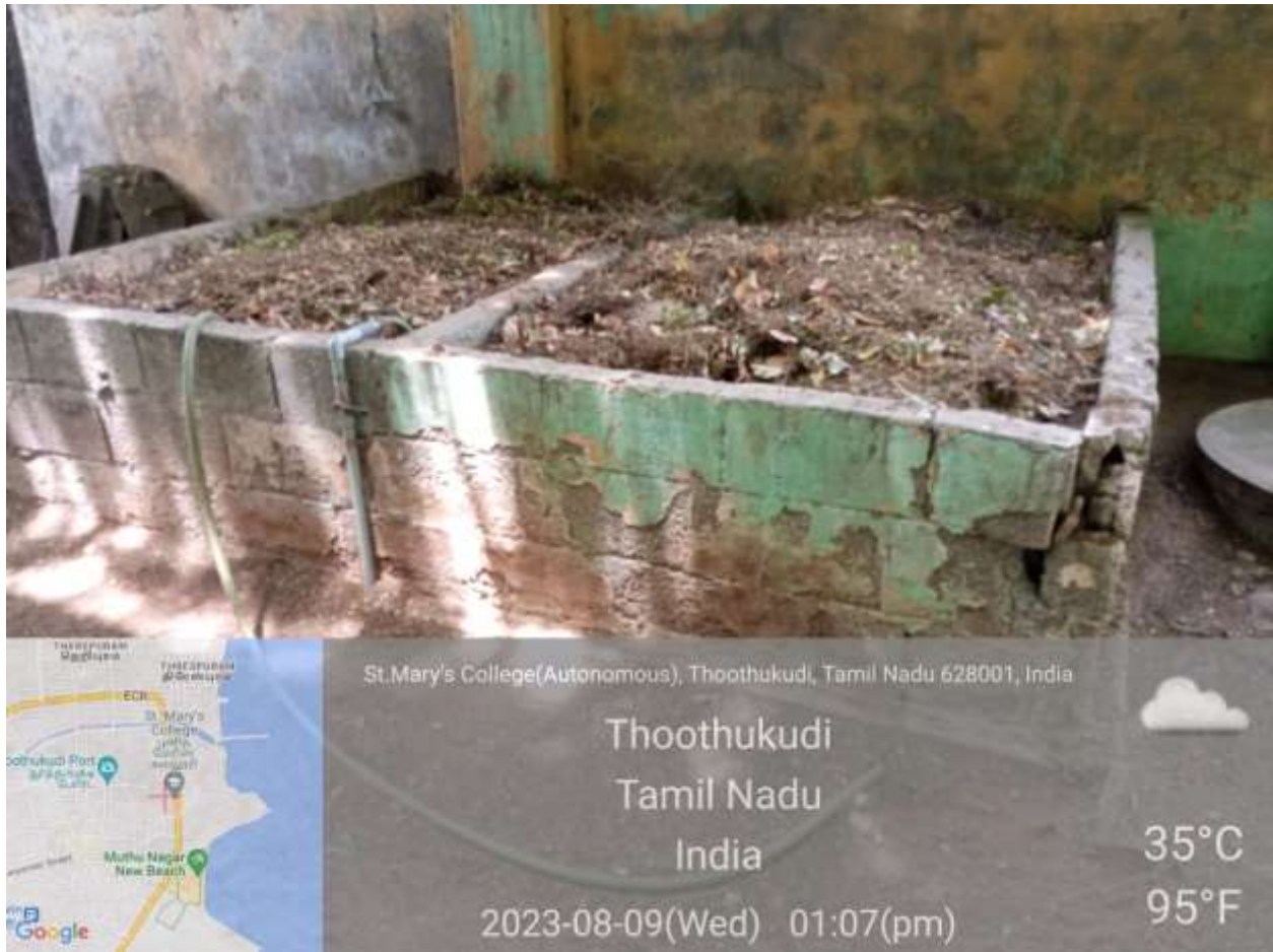
Solid Waste Management - Vermicompost