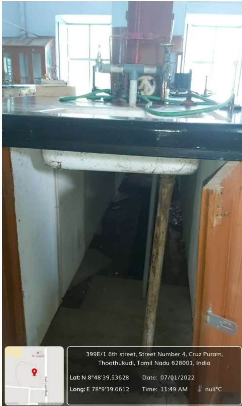
Liquid Waste Mangement