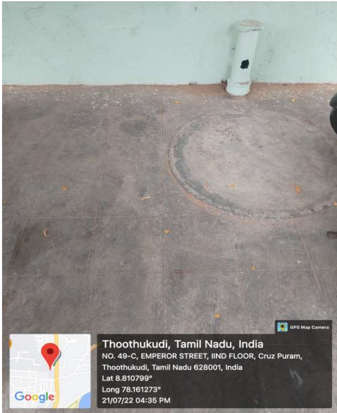
Liquid Waste Management