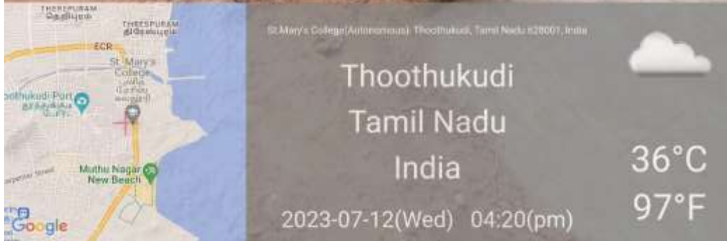
Liquid Water Management