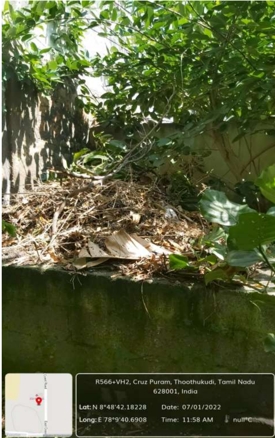
Solid Waste Management - Vermicompost