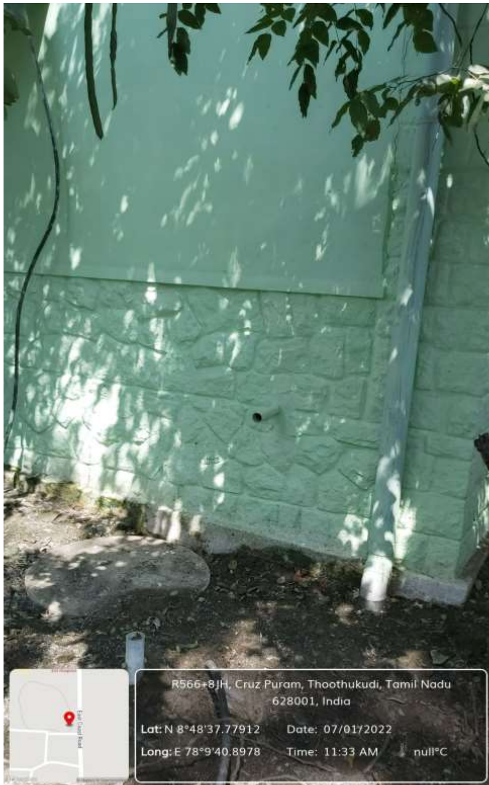
Liquid Waste Management