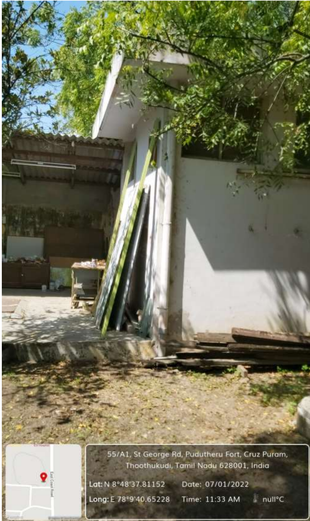
Liquid Waste Management