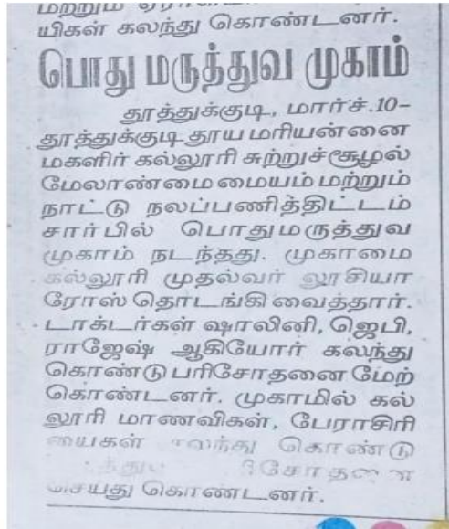
Description: Medical Camp