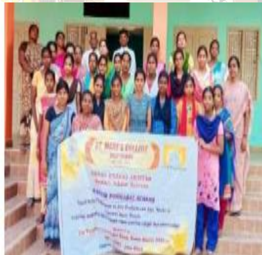
Description: Training Programme on Aari embroidery workshop