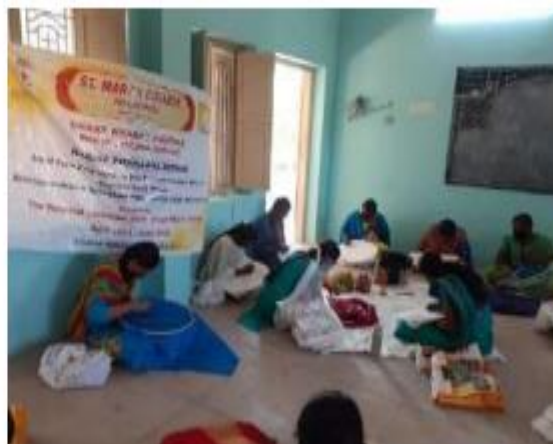
Description: A two-week Aari embroidery workshop for the women