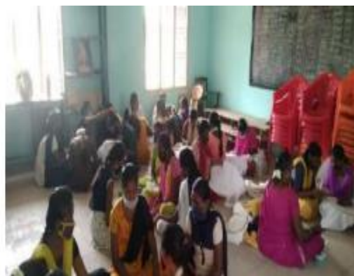
Description: A two-week Aari embroidery workshop for the women