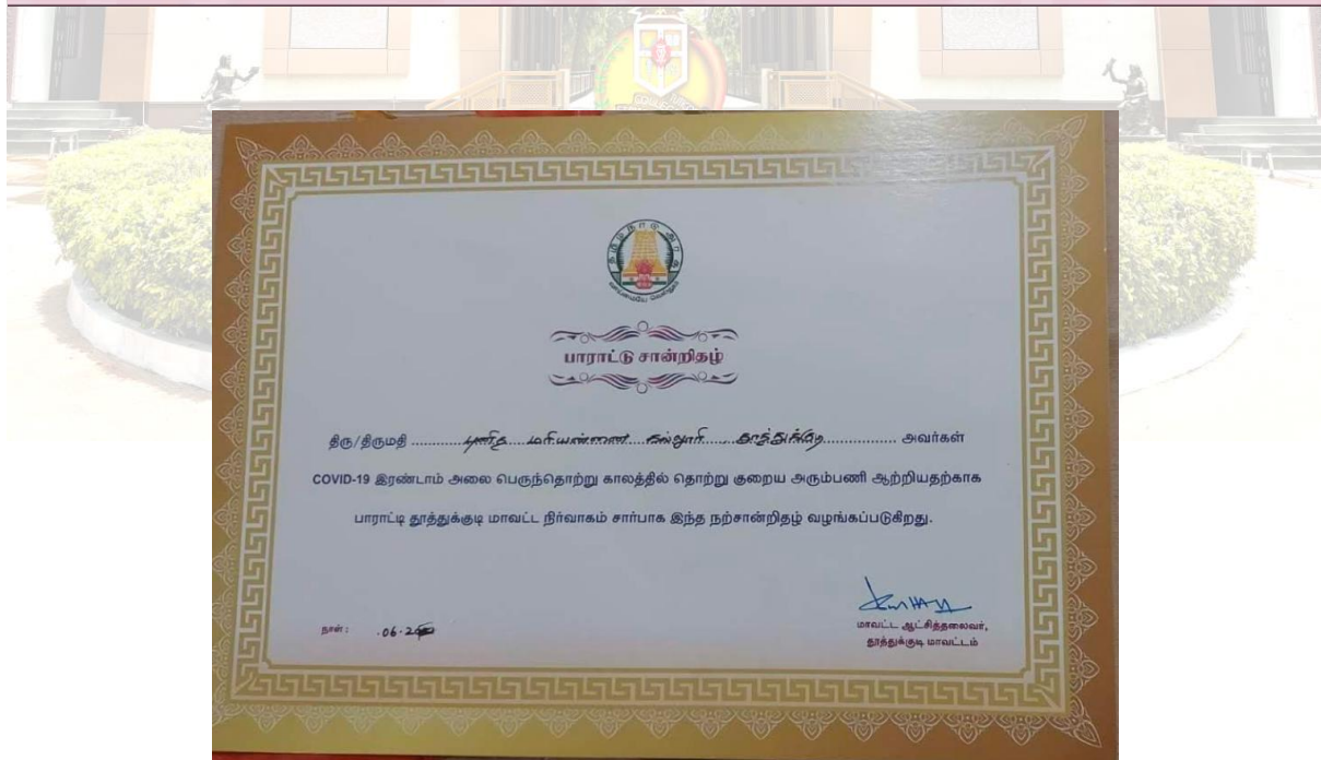
Description: Appreciation Certificate received from District Collector for rescue activities during the Second Wave of Corona