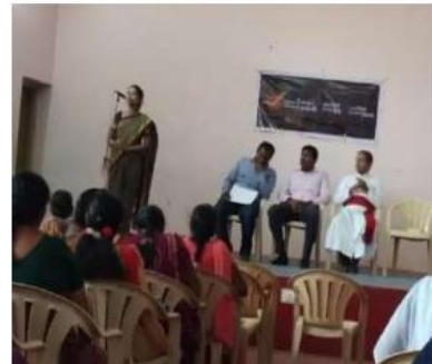
Talk on Postal Banking