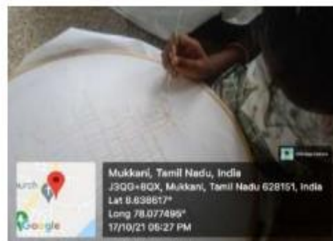
Description: A two-week Aari embroidery workshop for the women