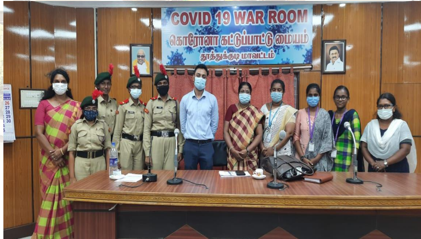
Description: Our students and teachers actively participated in Covid-19 War Room Activities