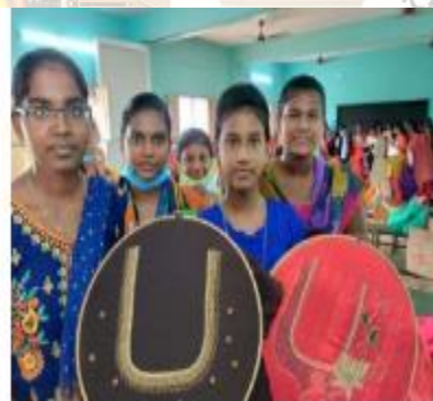
Description: A two-week Aari embroidery workshop for the women