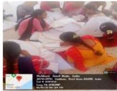
Description: A two-week Aari embroidery workshop for the women