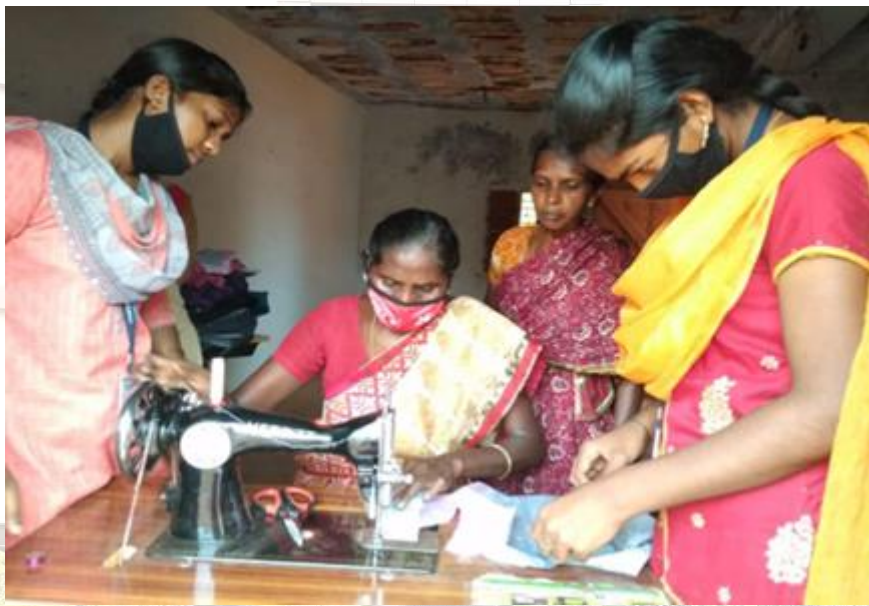
Description: Training Programme on Tailoring for women