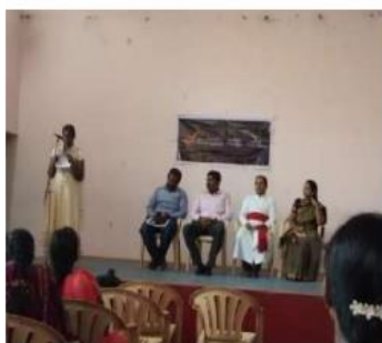
Awareness Song On Saving