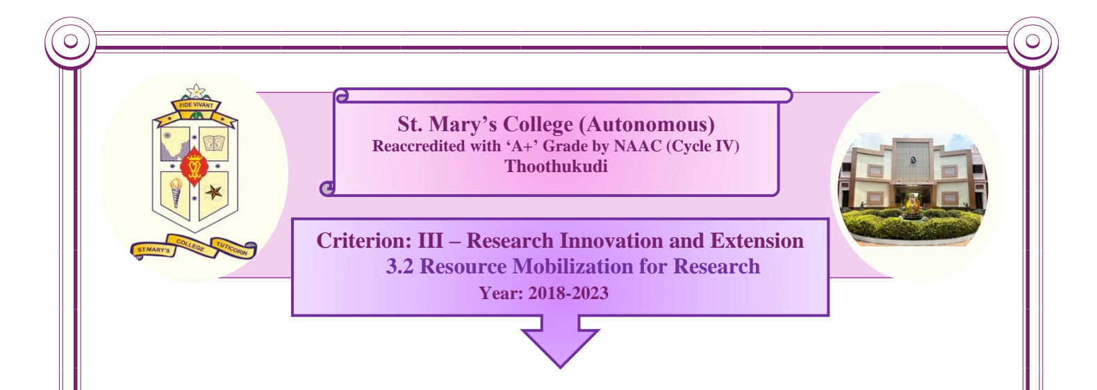
3.2.1 List of Extramural funding received for research, Endowment Research Chairs received during the last five years along with the nature of award, the awarding agency and the amount