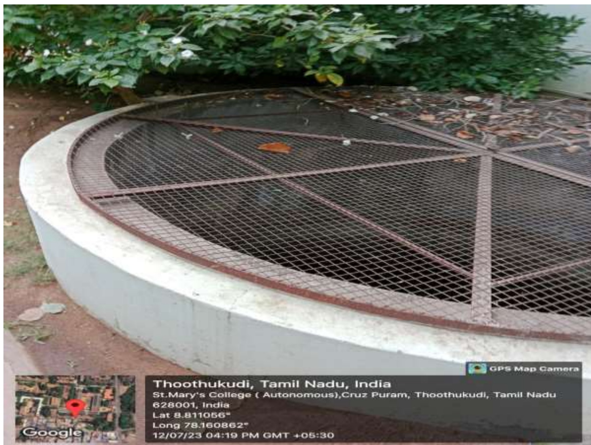
Borewell/Open well recharge

IQAC, St. Mary's College (Autonomous), Thoothukudi